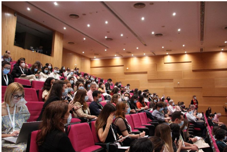
Fig 1 – Cross section of Participants

Activation of the Actin/MRTF-A/SRF signalling pathway in premalignant mammary epithelial cells by P-cadherin is essential for transformation