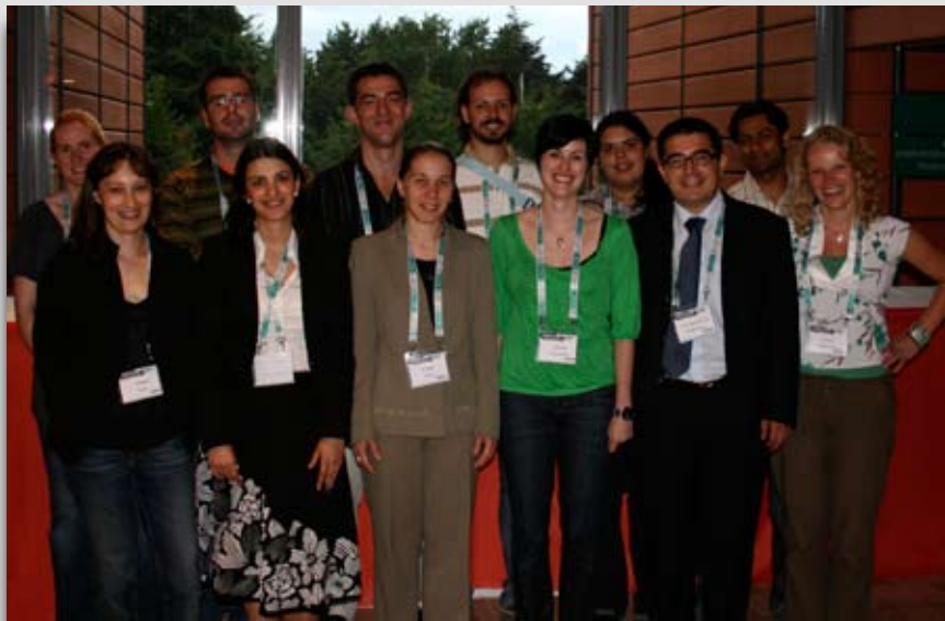
EACR Bursary Award winners gathered together following the General Assembly. Some of their reflections on the meeting appear overleaf.